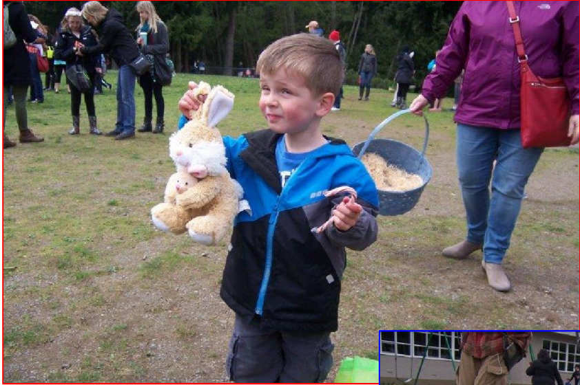
One intrepid young hunter was rewarded with a special prize for finding one of THE LUCKY CANDY CANES cunningly hide somewhere...