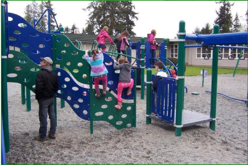
And it was great to see the playground which the Club helped fund and build a year ago getting a good workout.