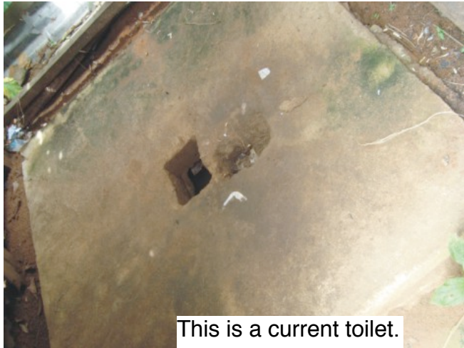
This is a current toilet.

This project has been put together by and two Rotary Clubs in Aba, Nigeria, and myself (Clifford Grant). I am now responsible for raising $15,000.00 for this project - a water well feeding into new toilets, basins, urinals and showers for students at a boys' school. During the political turmoil in Nigeria over many years the infrastructure was not maintained and fell into disrepair, including educational facilities. This academic school has approximately 600 students, boys from our grade 7 to 12. They desperately need toilets, basins and showers.