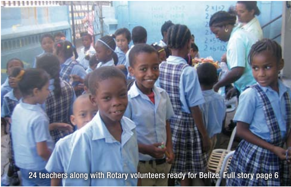
24 teachers along with Rotary volunteers ready for Belize. Full story page 6