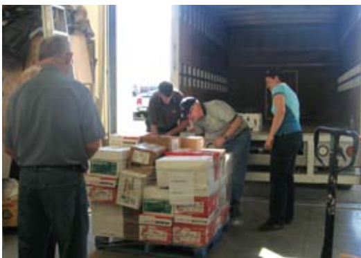
Teachers and Rotary volunteers loaded pallets at the HAWS warehouse