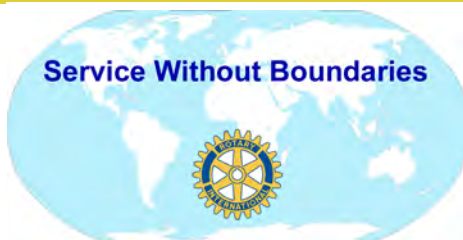
District 7470 Governor Avinash (Avi) Tilak