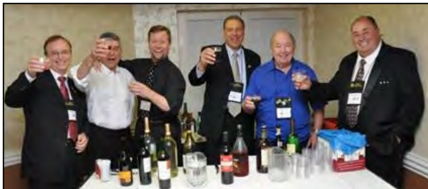
The rowdy bunch in Denville Rotary Club's hospitality room.