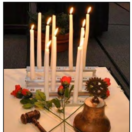
Memorial Service on Sunday