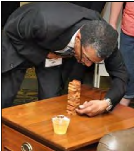
Jenga needs a lot of concentration, especially after a few drinks

And sometimes, no amount of concentration will help you