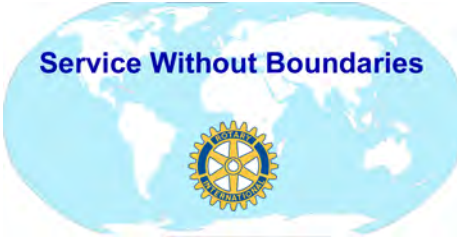
District 7470 Governor Avinash (Avi) Tilak