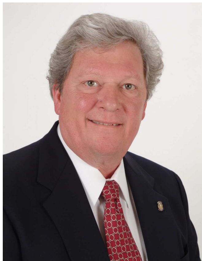
Governor Emil Geering