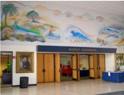
Hartley Auditorium Lobby