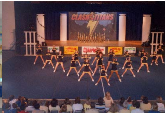
Hartley Auditorium Stage