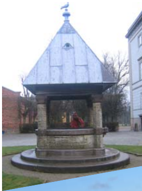
In the courtyard of my old school looking over a famous well. View across Sorø Lake to my school.

P.S. My Student Liaison Officer in the RC Kadina was ex-Premier John Olsen (before he went into state politics)