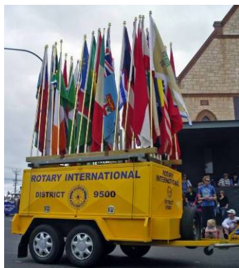
Float in the Tunarama Parade

They took in the atmosphere of the Tunarama Festival and also saw the aftermath of the December 23 fire ground, and toured Coffin Bay and Nyroca Scout Camp near Wangary.