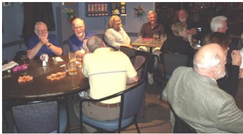
PubNight at the Legion