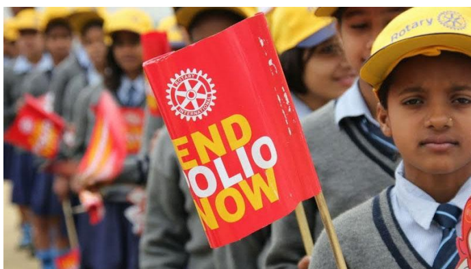
Schoolchildren participate in a rally organized by Rotary members in Ghaziabad, Uttar Pradesh, India, celebrating the country's achievement of polio eradication.

The World Health Organization certified on 27 March its 11-country Southeast Asia region has eradicated polio, a long-awaited declaration given that five years ago India represented nearly half of all polio cases worldwide. The region's last wild polio case was reported in West Bengal, India, on 13 Jan, 2011.