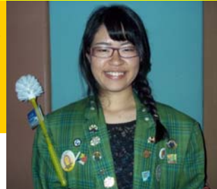
She is not allowed, however, to take it home!