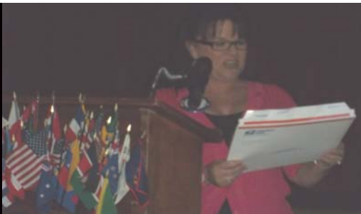
Poems that rhymed were not received well as the Prez's year winds down, so does her patience.