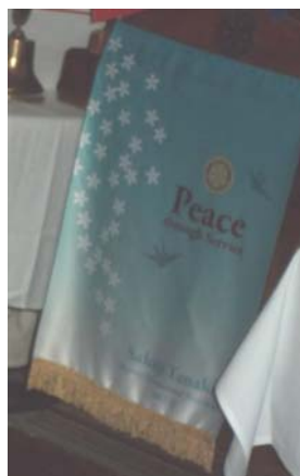
Peace Through Service