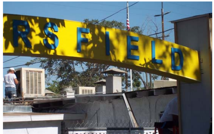
VFW Post 97 S. Union Ave. Painted exterior of 3 buildings, stucco repair, repaired grounds sign- saying Bakersfield, coolers repaired, started for the year, trees trimmed, yard mowed, walls repainted in pot/pan room along with floor leveling, purchased a new freezer when old one broke down during construction. This project started the last Saturday in April and has continued as grants have been awarded. Security door and entrance finished on Nov. 8th and many veterans have now a much more pleasant place to visit and receive services.