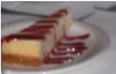
Raspberry Cheese Cake...This is good, but variety is the spice of life!