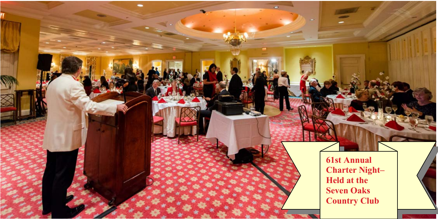
61st Annual Charter Night– Held at the Seven Oaks Country Club