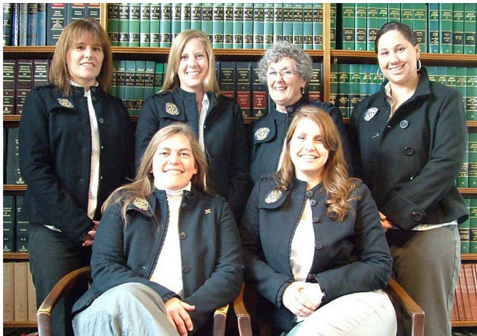
2010 GSE Outbound team to District 2290 in Norway