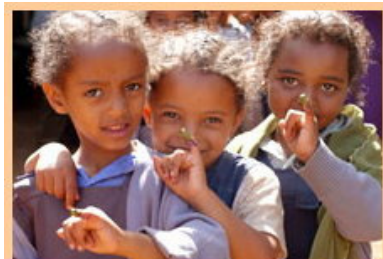
Three girls show their fingers marked with indelible ink after receiving the oral polio vaccine funded by Rotary. Addis Ababa, Ethiopia.

Rotary Direct enrollment is integrated with Rotary's secure online contribution system, which can accommodate contributions in any of 12 currencies. The recurring option is presented in Step 2 of the contribution process under the section titled "Frequency."